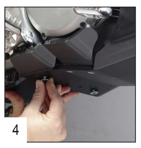
Place 2 TFHC 8x30mm screws in the rear holes.