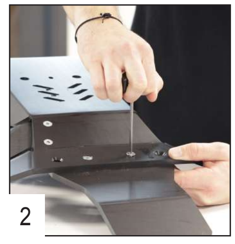
Use 2 TFHC 6x16mm screws to fix the linkage guard. Note: these are auto-tapping screws.