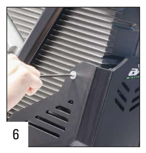
Tighten the front screws.