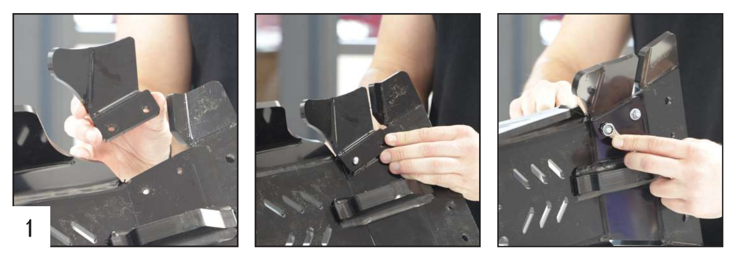
Place the footpeg protection on the right side using 2 TFHC 6x25mm screws + M6 washers and bolts, then tighten.