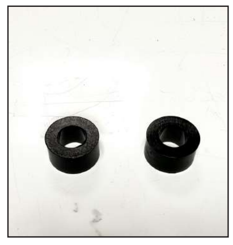
if you don't put the linkage guard, place 2 spacers between the plate and the frame, then tighten the screws.