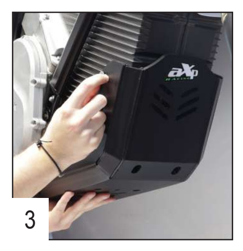
Place one TFHC 8x20mm screw on each side without tightening.