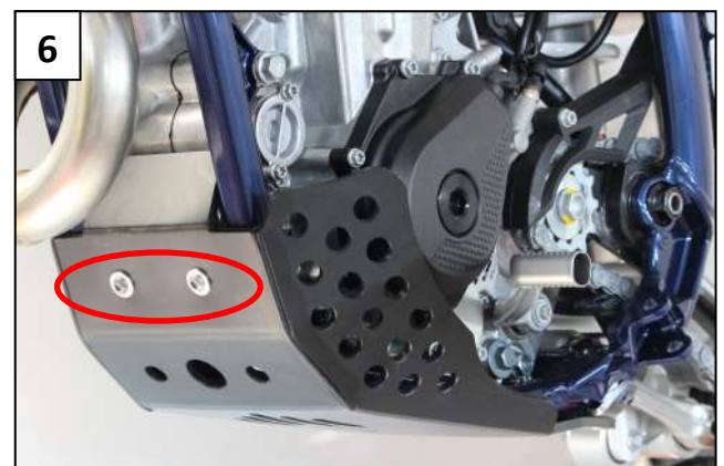
2 Alloy spacers + 2 Tbhc 6x35mm