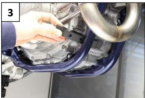
Place the front bracket by the side Placer la fixation par le côté