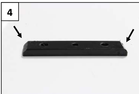
The 8mm plate has to be placed with the chamfered sides going inside of the frame and will be fixed by auto drilling in the 20mm part. La plaquette 8mm doit être placée avec les côtés chanfreinés à l'intérieur du cadre et fixée par auto perçage dans la bride 20mm