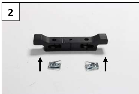
PM01-04-231 + Clamped bolts