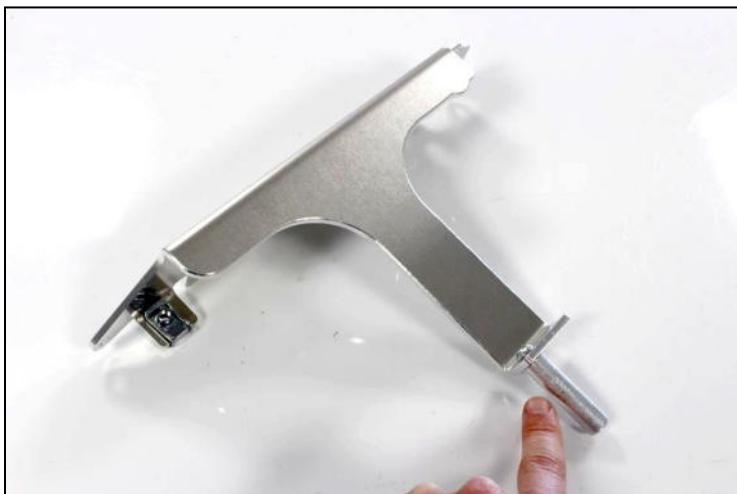
TBHC 6x16mm + 45mm spacer