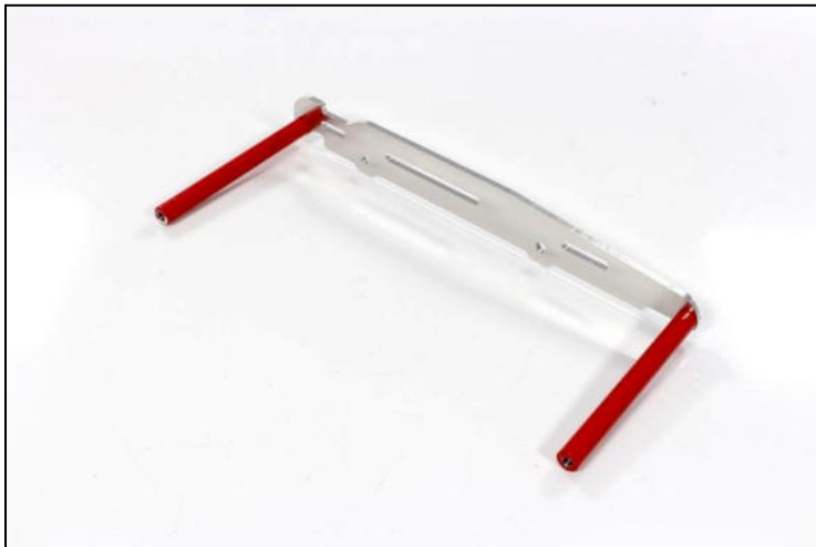
TBHC 6x16mm + Red spacers 122mm