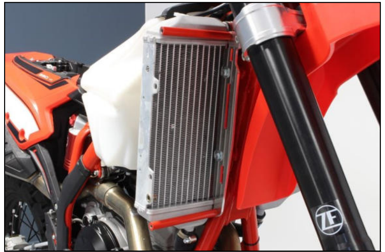
TBHC 6x16mm + Red spacers + M6 Large washers