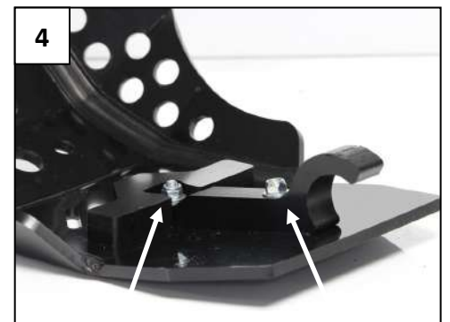
1 Tfhc 6x25mm 1 Tfhc 6x30mm 1 M6 Washer 1 M6 Washer 1 Em6f 1 Em6f