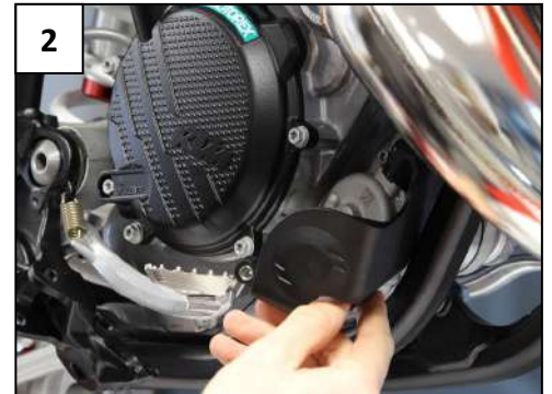
Remove the OEM plastic Retirer le cache plastique