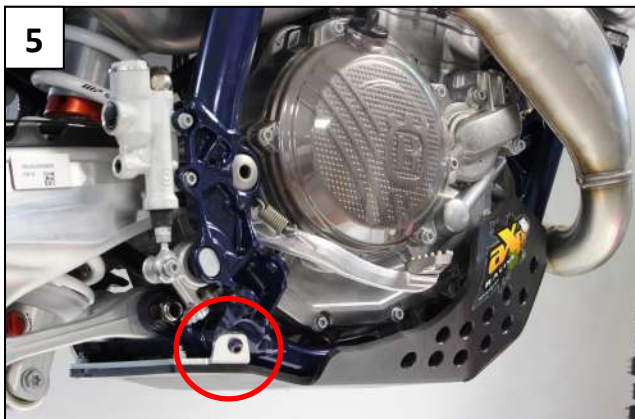
5 OEM Screws + M6 Washers