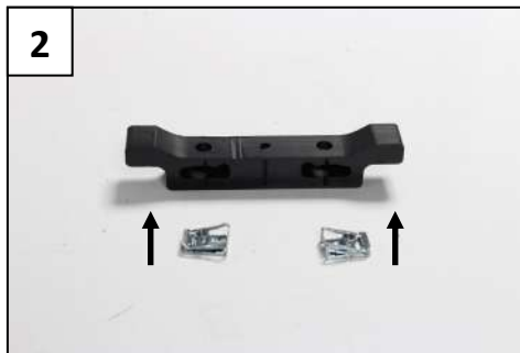
2 PM01-04-231 + Clamped bolts