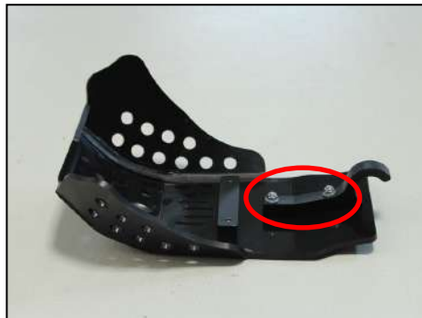
Tfhc 6x30mm + M6 washer + Em6f