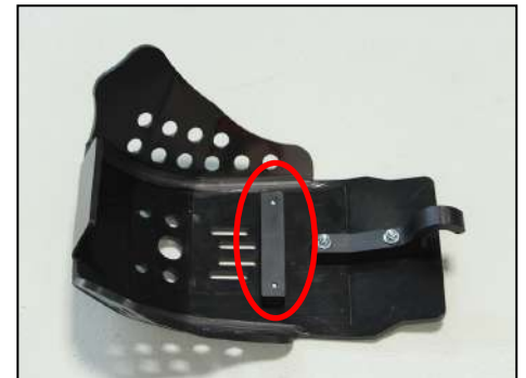
Tfhc 6x20mm by manual drilling / par auto perçage