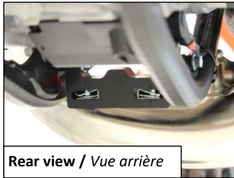
Rear view / Vue arrière

Put the clamped bolts inside of the plastic block / Insérer les écrous pinces