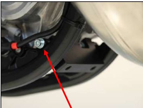
Tchc 6x45mm + M6 washer

Place the front plastic fixation as shown / Placer la fixation avant suivant les photos : 2 Tchc 6x45mm + 4 M6 Washers + 2 Em6f