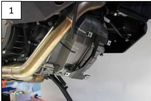
1 Remove the OEM skid plate and keep the front fixation