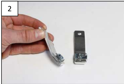
2 Place the clamped bolts as shown (2) and fix it on the bike on left and right sides using the OEM screws + M6 Washers + Em6f (3)