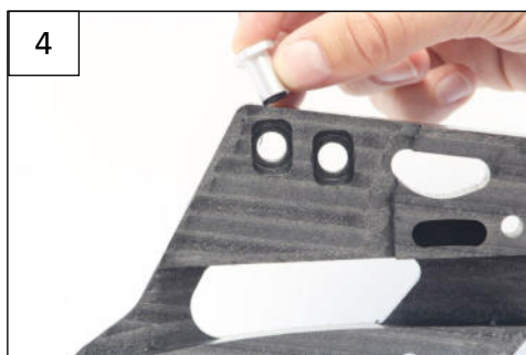
Place the threaded ring as indicated on the pictures Placer la bague taraudée comme indiqué sur les photos