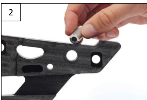
Place the alloy smooth spacer as indicated on the pictures Placer l'entretoise lisse comme indiqué sur les photos