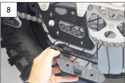
Place the second bloc, clip it and tight with the Tfhc 6x55mm screws, M6 Washers and em6f Placer le second bloc, clipser et serrer le tout avec les tfhc 6x55 + Rondelles M6 et les Em6f