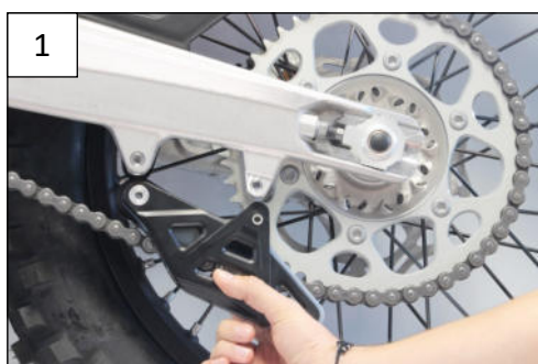
Remove the OEM chain guide Enlever le guide chaîne d'origine

Scan with your iPhone Camera OR Use «QR Code Reader» app' for Android's