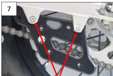
Use OEM screws Utiliser les vis d'origine