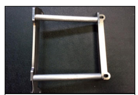
This is the bloc