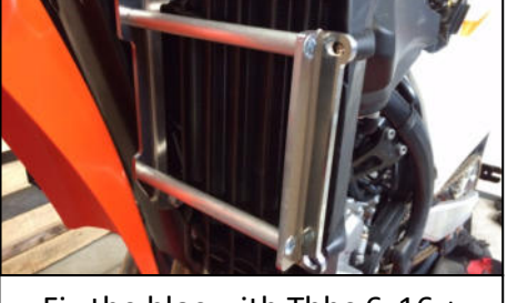
Fix the bloc with Tbhc 6x16 + R.M6 on the air deflector points