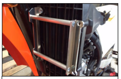
Fix the bloc with Tbhc 6x16 + R.M6 on the air deflector points