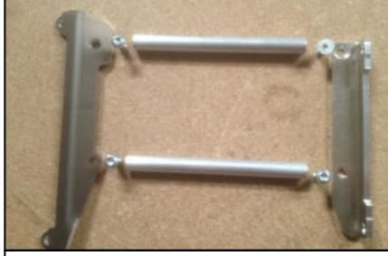
Fix spacers and alu parts