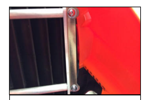
Fix the plastic with Tbhc 6x20 + R.M6