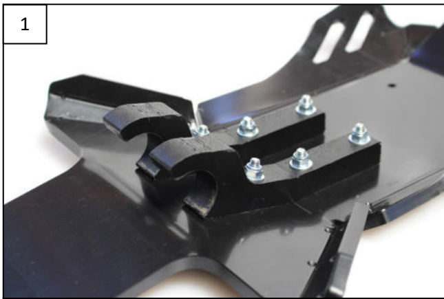
1 Fit the rear plastic brackets with Tfhc 6x35 + em6f + washers

AX1445 Orange Xtrem Skid Plate KTM EXC250/300