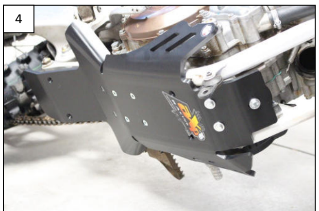
4 Fix the front with TH6x25 mm + Alloy spacers