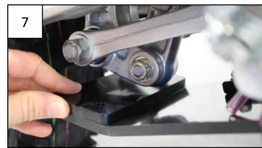
TFHC 6x25mm + washers + em6f Put the reinforced plate in place Mettre la plaque de renfort en place