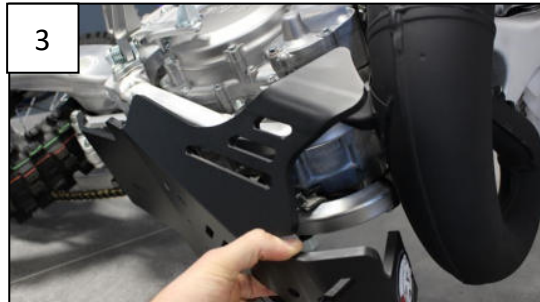
Put the skid plate in place Insérer le sabot sur la poutre AR