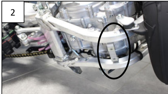
PM02-01-013 + Clamped Bolts