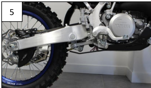
Put back the bike straight Remettre la moto droite