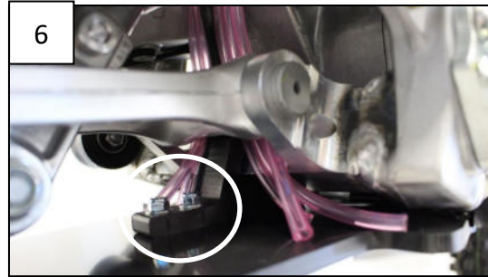
PM01-04-161 + TFHC 6x25mm + washers + em6f Put the rear plastic mount in place Mettre le contre crochet en place