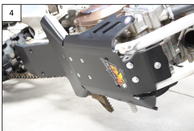
4 Fix the front with TH6x25 mm + Alloy spacers