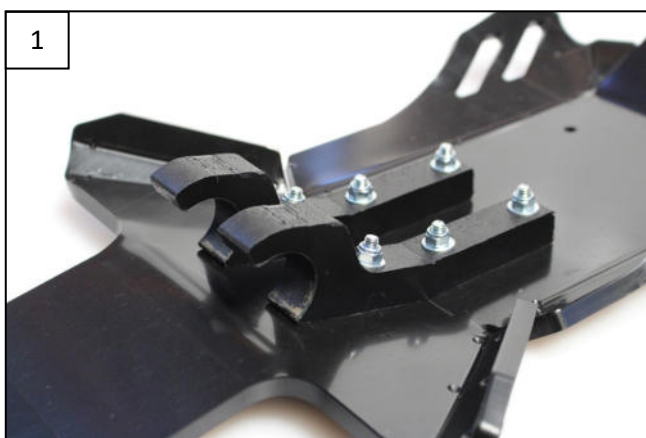
1 Fit the rear plastic brackets with Tfhc 6x35 + em6f + washers