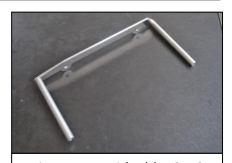
Fix spacers with Tbhc 6x16