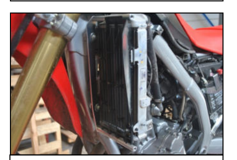
Put back the air deflector