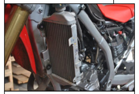
Put down all components