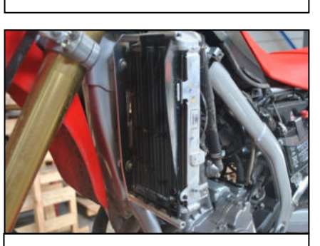
Put back the air deflector

4 NE01-01-001 Tbhc 6x16 1 NE01-01-009 Tbhc 6x20