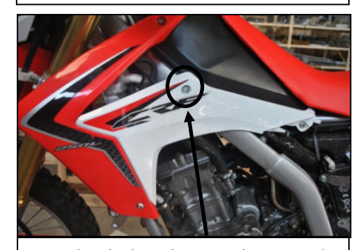
Put back the platic with original scres except 1 Tbhc6x20 + R.M6 as indicated