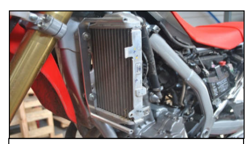
Fix the kit on the radiator with original screws