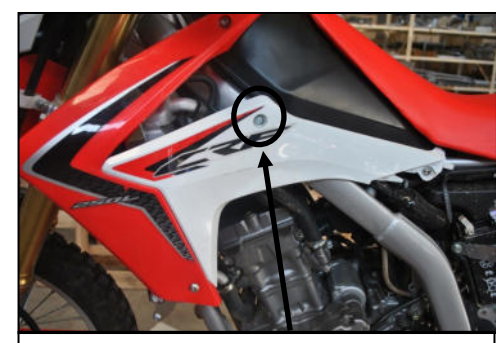
Put back the platic with original scres except 1 Tbhc6x20 + R.M6 as indicated