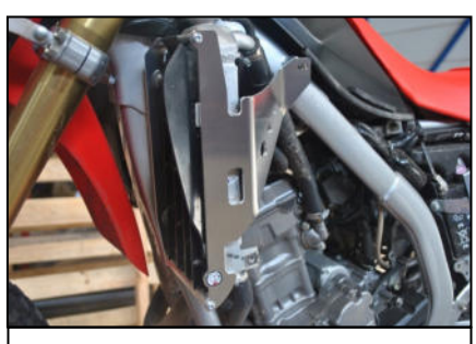
Fix the big side with Tbhc 6x16