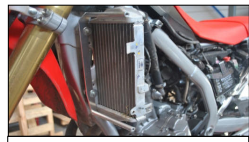
Fix the kit on the radiator with original screws