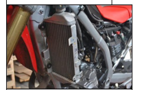
Put down all components