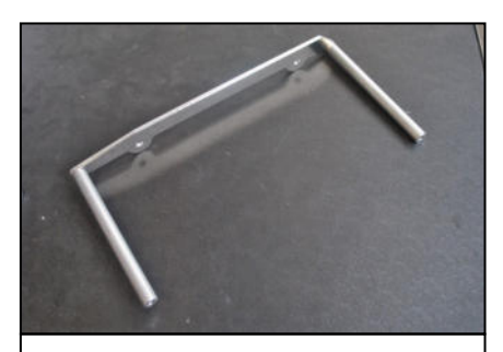
Fix spacers with Tbhc 6x16