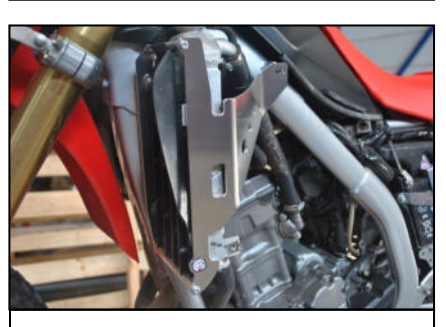
Fix the big side with Tbhc 6x16